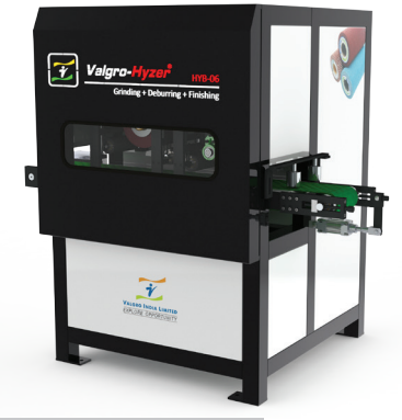
Valgro India Ltd www.valgro.co.in Hall 2A, Booth C102