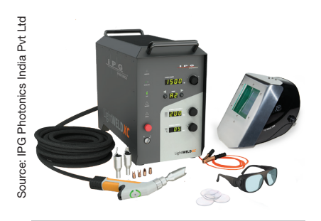
IPG Photonics India Pvt Ltd www.ipgphotonics.com Hall 4, Booth C101

ightWELD 1500 XC is an extended version of the existing LightWELD 1500 system used specifically for welding applications. It enables fabricators to immediately realize time and cost-saving benefits as compared