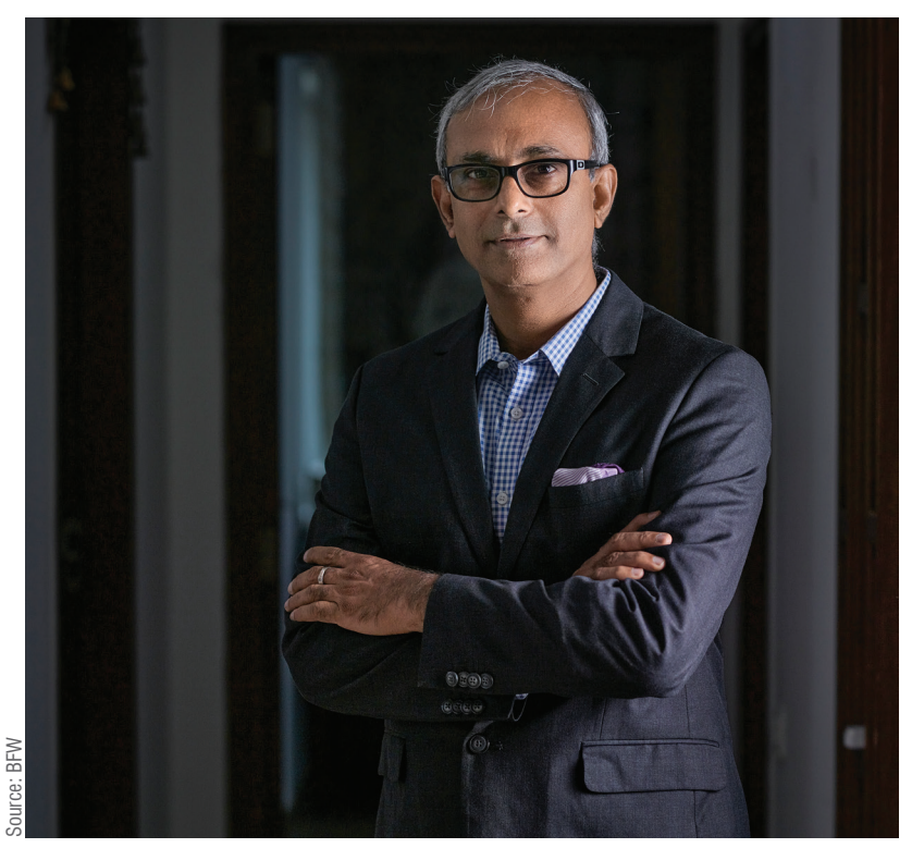
I am happy we are finally meeting face-to-face, physically shaking hands, witnessing technologies, and touching and feeling products again. The response to the show has been magnificent.