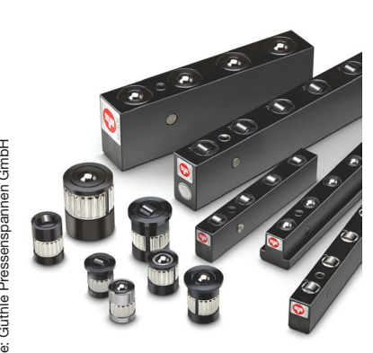
Güthle Pressenspannen GmbH www.guethle-swt.de Hall 3A, Booth E103

he conventional procedure for changing press tools often becomes tedious and potentially dangerous when handling dies weighing more than 500 kg.