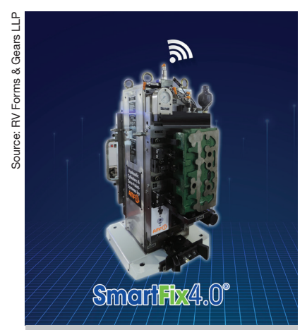
RV Forms & Gears LLP www.formsandgears.com Hall 3A, Booth F113