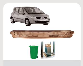
Plastic Industry AMPCOLOY*83/944/940/95