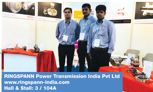
RINGSPANN Power Transmission India Pvt Ltd www.ringspann-india.com Hall & Stall: 3 / 104A