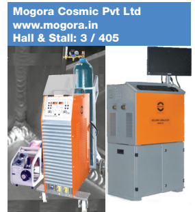
Mogora Cosmic Pvt Ltd www.mogora.in Hall & Stall: 3 / 405

WELDING SIMULATOR (Real Arc): Welding Simulator, LIVE ARC-RMI is a new and innovative reality-based training system which can interface with a real machine. It delivers training in two steps: first with micro arc and second with real machine interface. It supports three different welding processes such as MMAW, GMAW, GTAW. The simulator is designed to train, screen, recruit, requalify and manage the performance of a welding trainee. It is claimed to be better, faster and more effective than any conventional training methods. Its unique motion tracking technology provides a trainee's critical feedback like arc length, welding speed, angle of torch (X & Y), welding voltage, welding current, and wire feed speed. The system provides the welding instructor the ability to configure assignments and technique parameters. It stores the performance record of the trainee for future evaluation. It complements the instructor by reducing both the training time and the cost of the materials while accelerating the performance. The simulator can be interfaced with real welding machines like MIG, MMA, TIG to measure the actual welding time parameters.